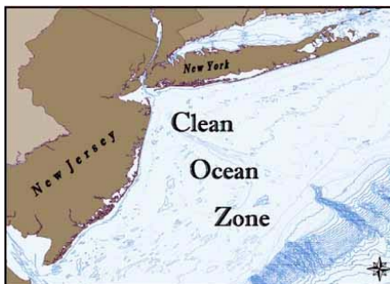
The Clean Ocean Zone is needed for continued protection of the ocean.