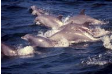
Bottlenose dolphins in the NY/NJ Bight.

Some stand at the water's edge and see an endless sea, a boundless expanse. One of the many fascinating ecosystems within this vast watery world is located here off the New Jersey and New York coasts. The coasts of NY and NJ and the Gulf Stream, a strong ocean current, create a triangular mini-sea "wedge" within the big ocean, officially known as the NY/NJ Bight . The physical, biological, and hydrodynamic characteristics of this 19,000 square-mile area are extraordinary as more than 300 species of fish, nearly 350 species of birds, 7 species of sea turtles, and many marine mammals, such as 25 species of whales and dolphins and several species of seals and porpoises, frequent this region. The ecological richness of the region is astounding. This fantastic seaway feeds the souls of millions and provides an economic mainstay for multi-billion dollar industries.